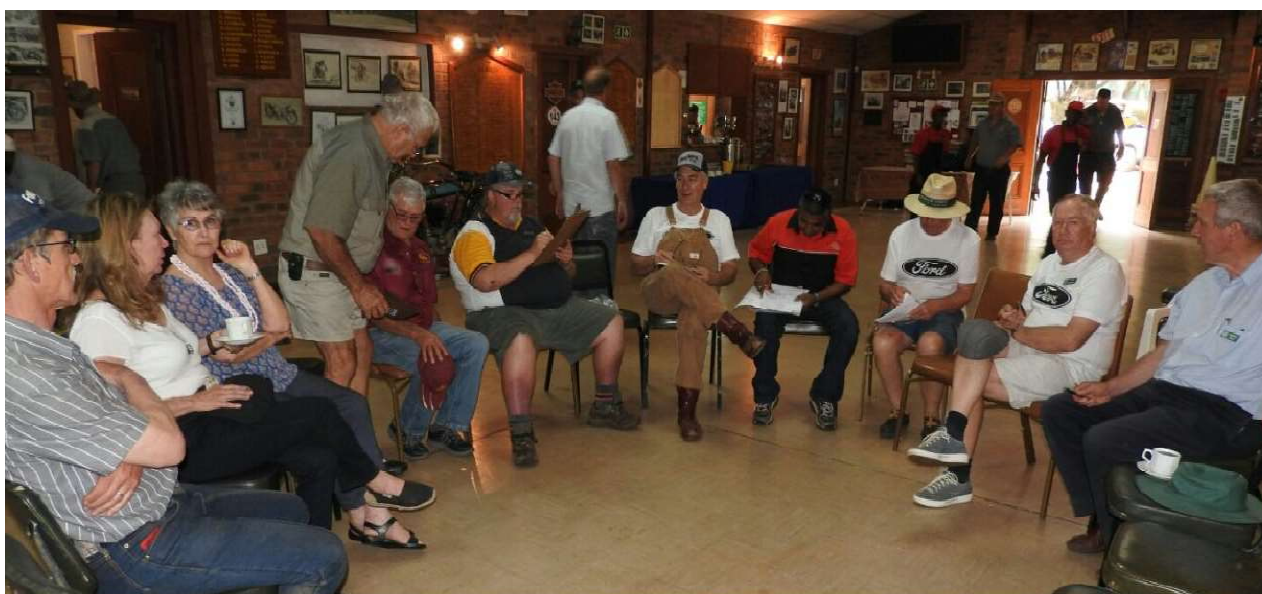
Above: Some of the attendees of the founding meeting