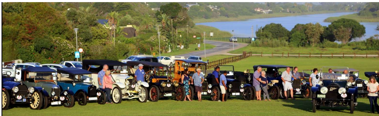
Above: participants on the 2018 Ford Veteran and Vintage Tour